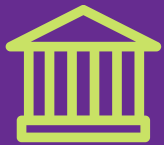
Mayors and other City Officials

Partners beyond school can share information and connect families with SNAP and other food resources. Champions for schools can share information, host events, or connect families to the nutrition safety net programs.